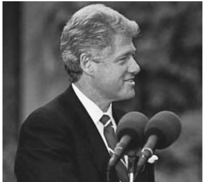
Bill Clinton - Former President of the United States and Golden Key Honorary Member