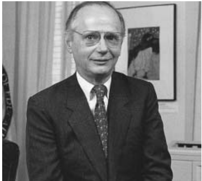
Richard Riley - Former U.S. Secretary of Education and Golden Key Honorary Member