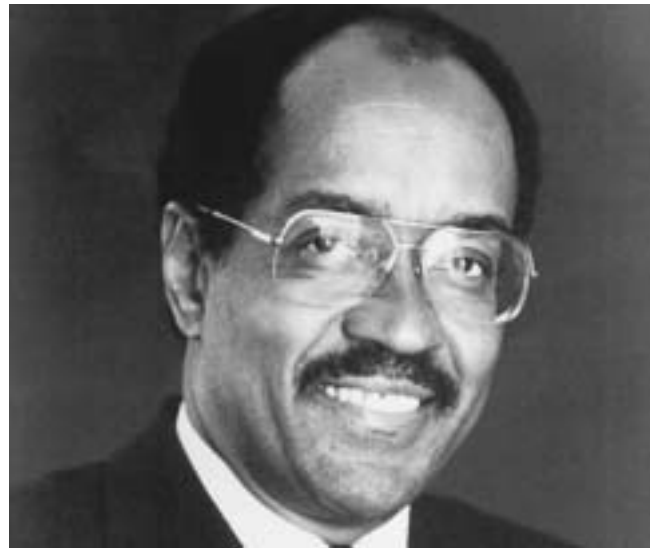
William Gray - President of the United Negro College College Fund and Golden Key Honorary Member