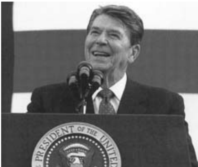
Ronald Reagan - Former President of the United States and Golden Key Honorary Member