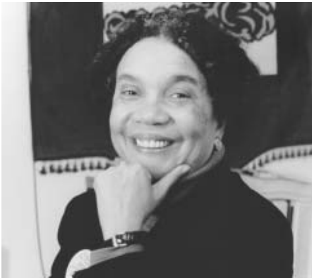
Marian Wright Edelman - Founder and Executive Director of the Children's Defense Fund and Golden Key Honorary Member