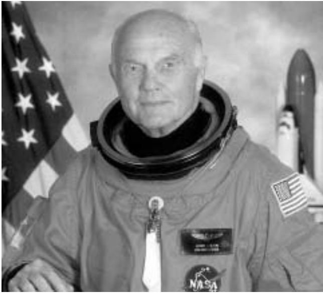
John Glenn - Former Senator and Astronaut and Golden Key Honorary Member