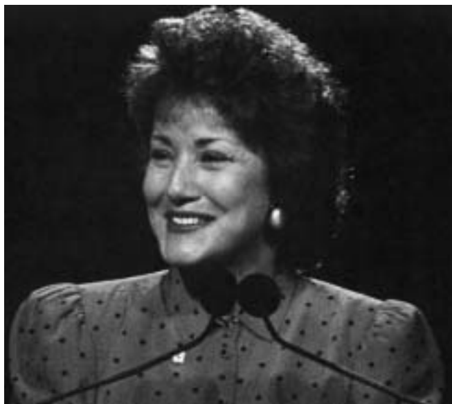
Elizabeth Dole - Past President of the American Red Cross and Golden Key Honorary Member